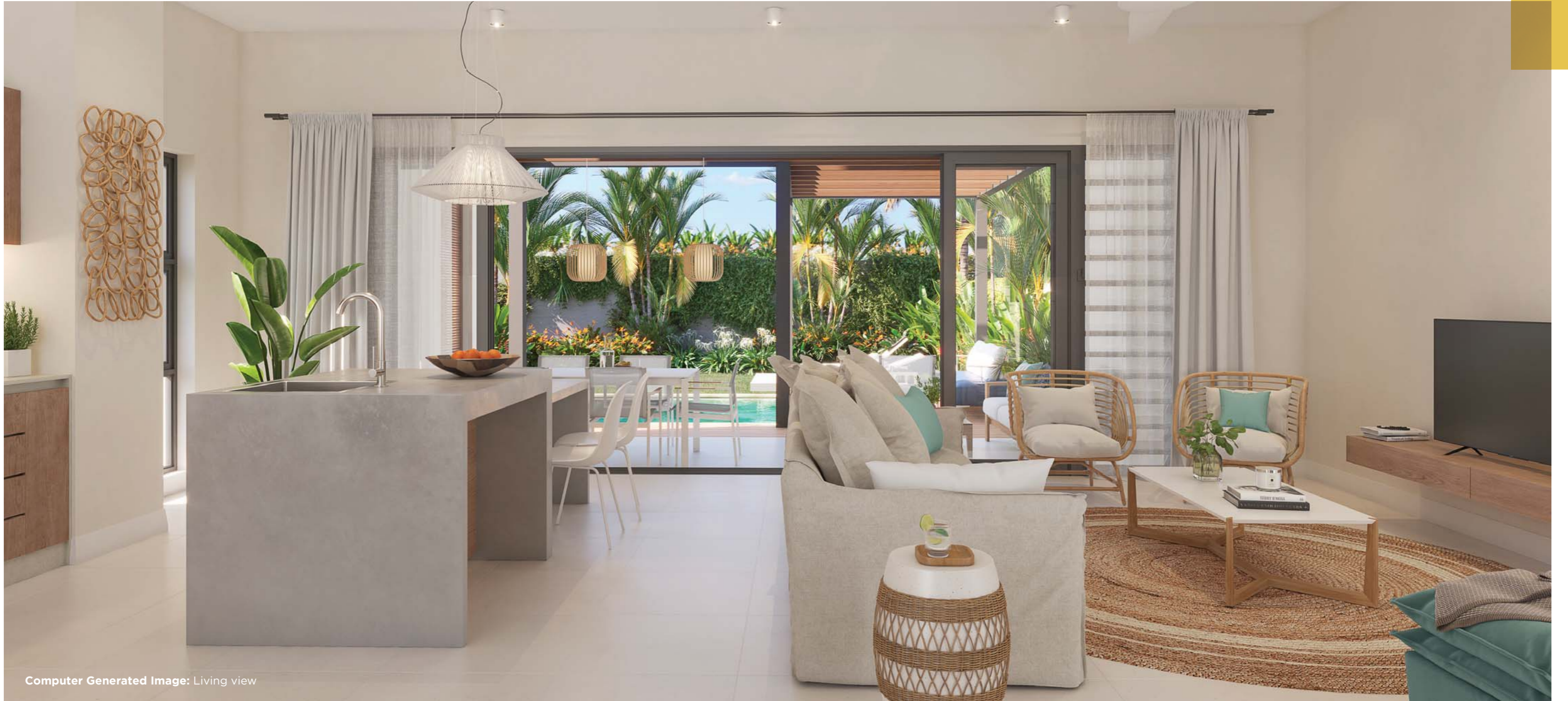
Computer Generated Image: Living view