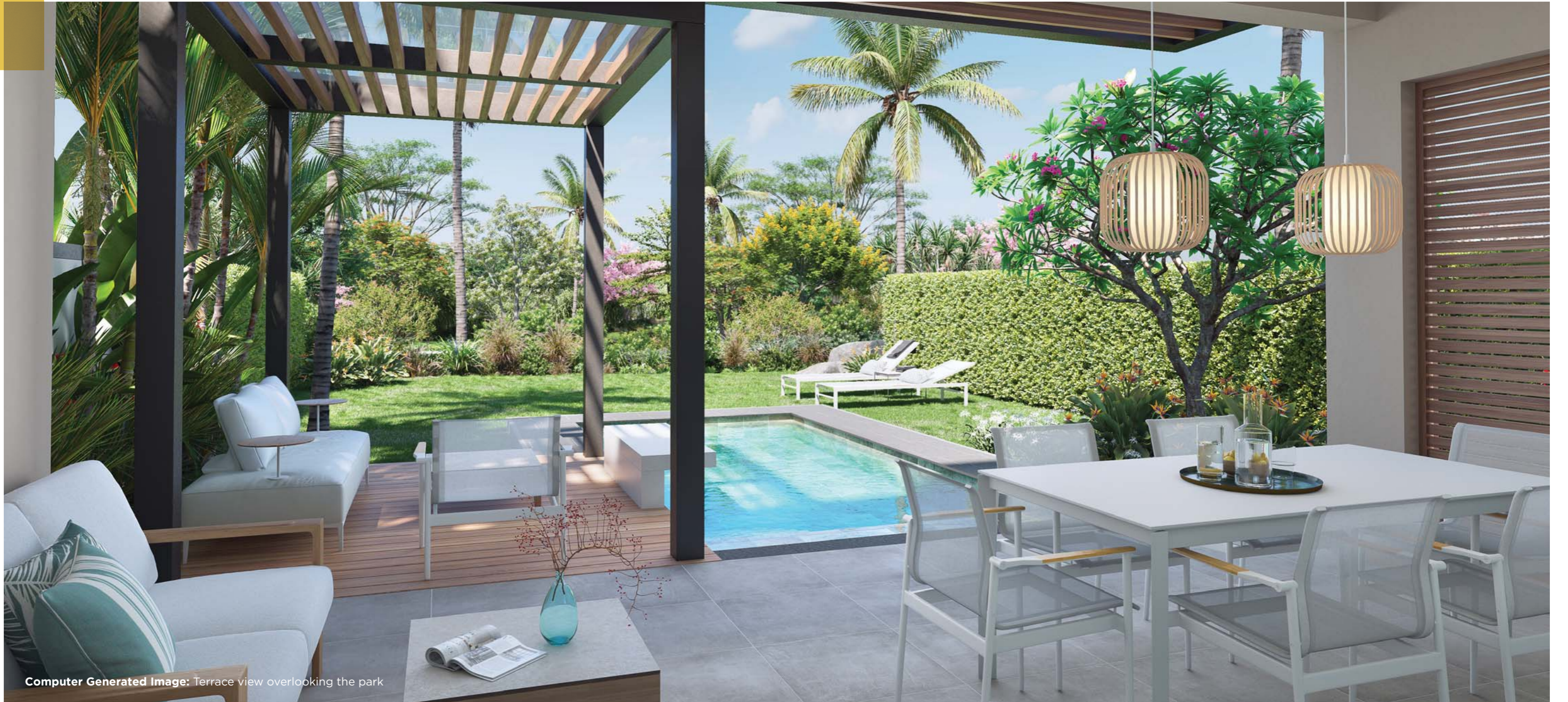
Computer Generated Image: Terrace view overlooking the park