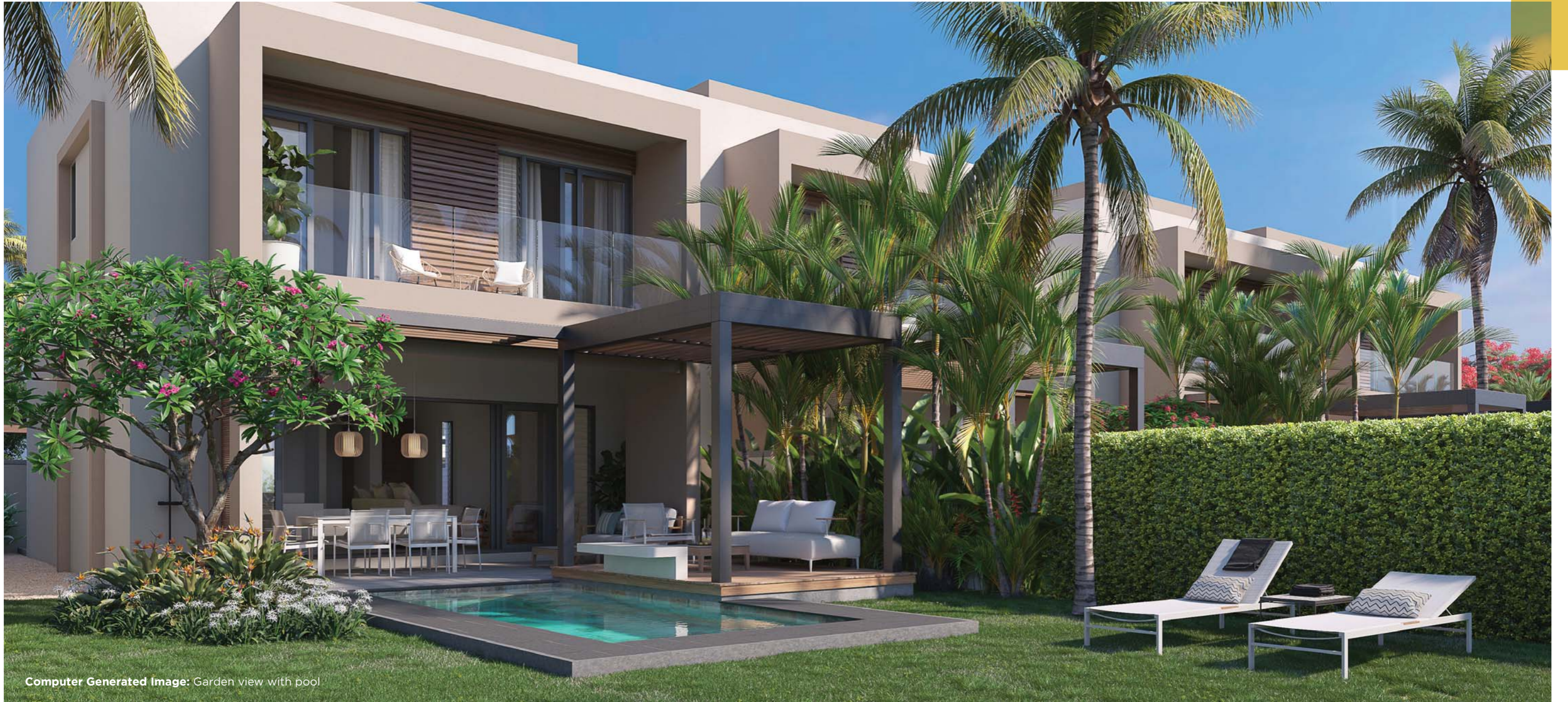
Computer Generated Image: Garden view with pool