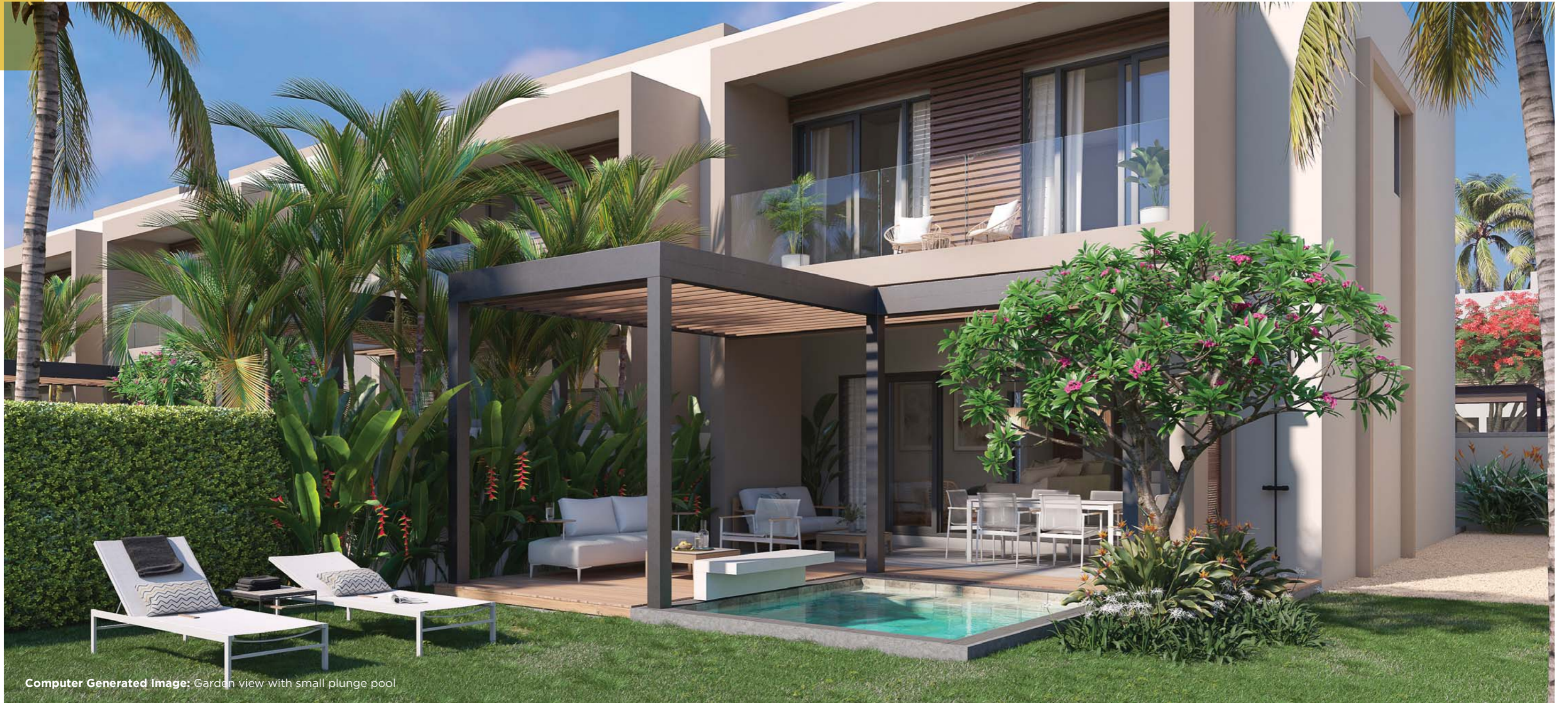
Computer Generated Image: Garden view with small plunge pool