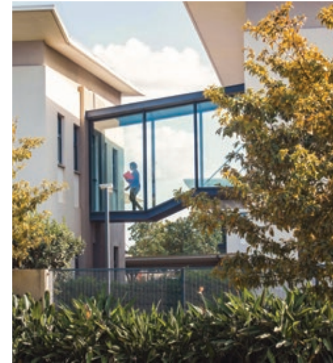
| Unicity Office Park

As the gateway to the West, Unicity redefines urban living. It seeks to place people and nature at the heart of its growth and is based on a sustainable vision of daily life that encourages connections, invites people to make time for themselves, and is rooted in the concept that pleasure shared is pleasure doubled.