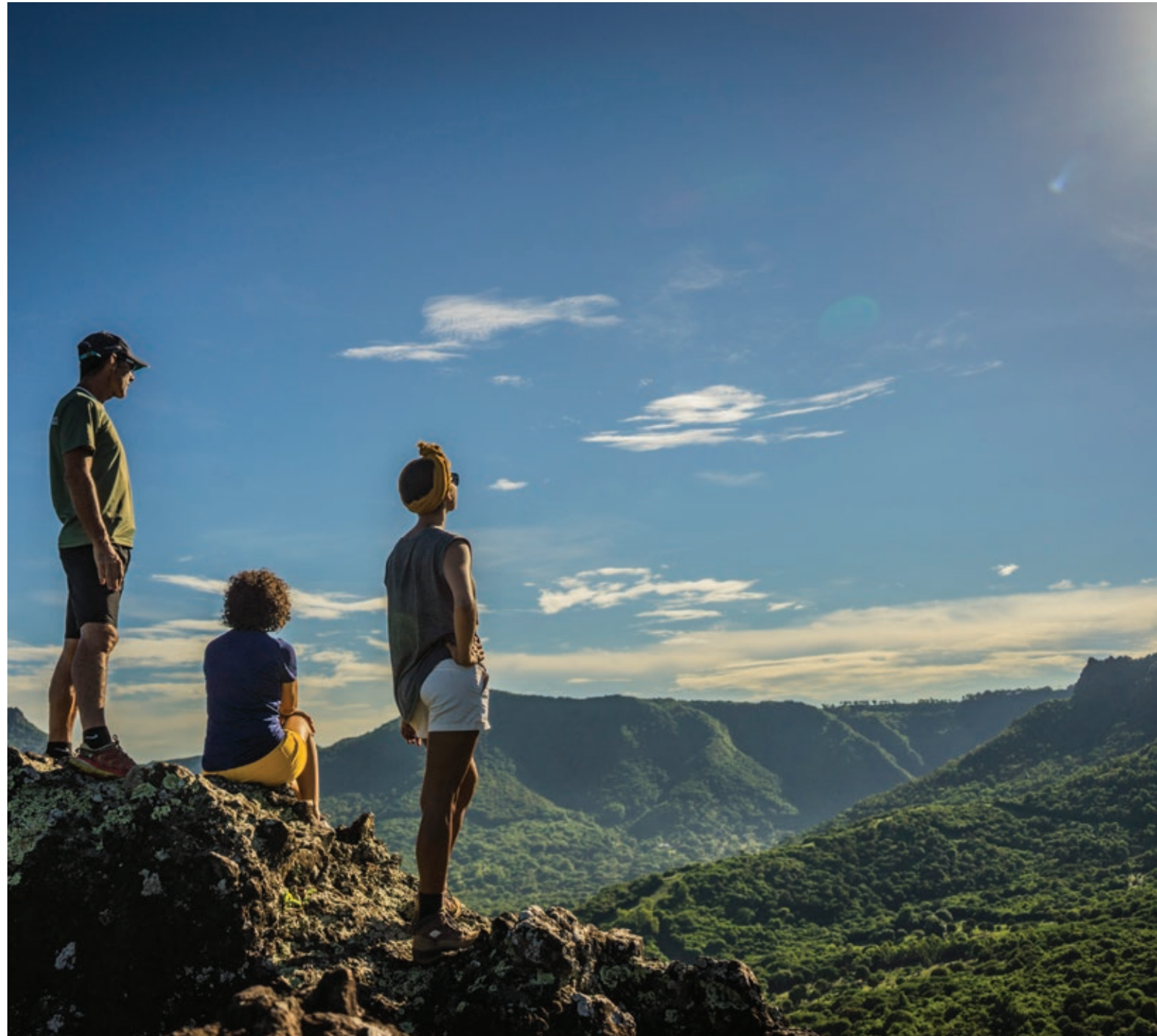
Yemen Nature Reserve

The illustrations and content of this brochure are only indicative and non-contractual. No representation or warranty is expressly or impliedly given as to its accuracy, completeness or correctness. All copyrights, design and other intellectual property rights regarding the design, products, images and content of this brochure, are and will remain the property of the Medine group. Medine Limited hereby reserves the right to unilaterally modify, revoke, alter, add or delete any content of this guide, without notification nor any liability.