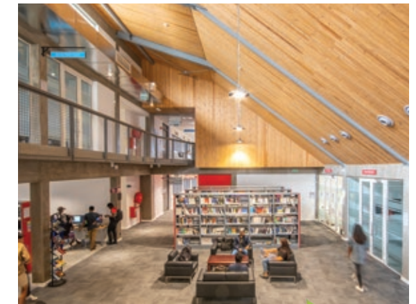
Middlesex University Mauritius Uniciti Campus