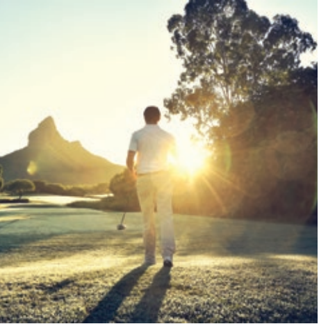
Tamarina Golf Club