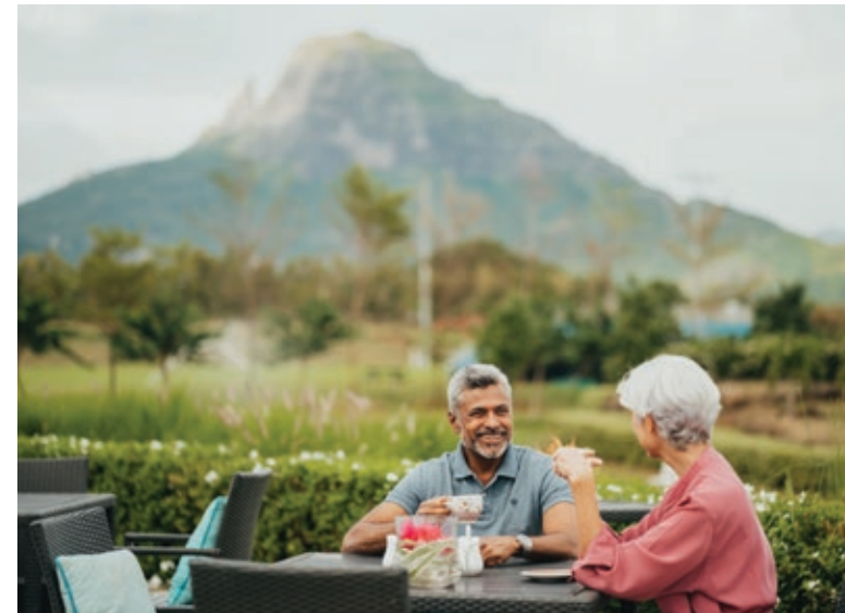
CommonGround at SPARC Sports & Medical Centre

The Grove pays tribute to Mauritius' tropical climate and the island's lush, beautiful nature. With their spacious terraces to relax on and generously sized living areas that offer an abundance of natural light and cross-ventilation, its residences invite the outside in.